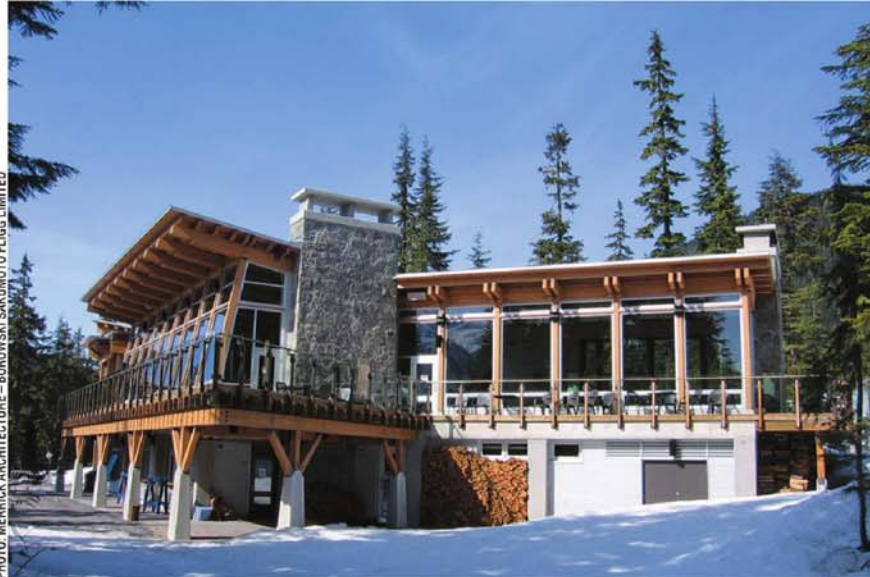
Above: Whistler Olympic Park Day Lodge, Whistler, B.C. Below: Talon at Eaglewind, Squamish, B.C.